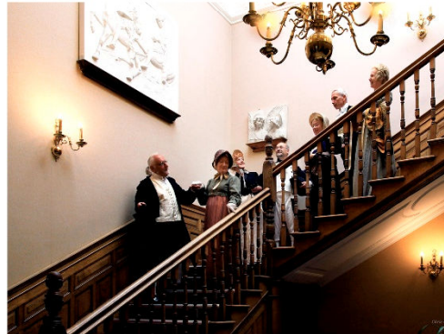
A musical entertainment "The Food of Love" performed by the Early Music Ensemble 'Hexachordia'

Norwich High School for Girls is based around the fine Regency house of Eaton Grove.